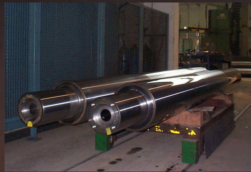
Rolls and back-up rolls for hot heavy plate leveller