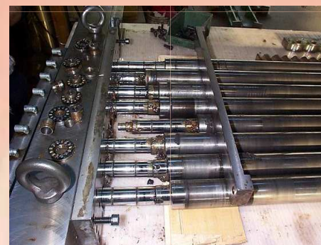
Refurbishing of assembled sets